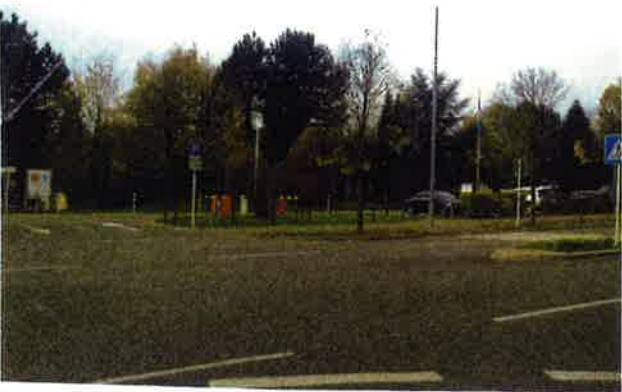
Campus Kirchberg: Entrance (top) and Parking (bottom)